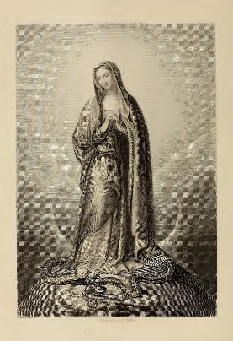
THE IMMAGULATE CONCEPTION FROM TROOF OF THE ROLLES SEUS IX