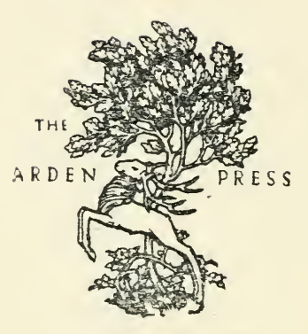
W. H. SMITH AND SON FETTER LANE LONDON EC AND LETCHWORTH